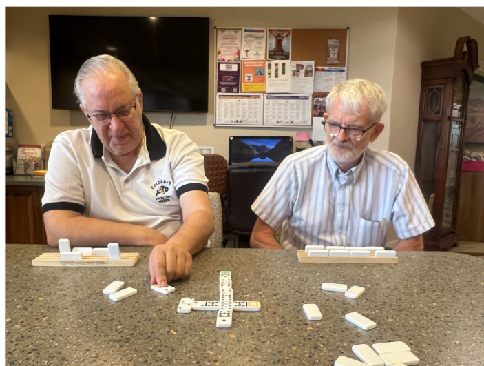
Men's Group at MorningStar Assisted Living.