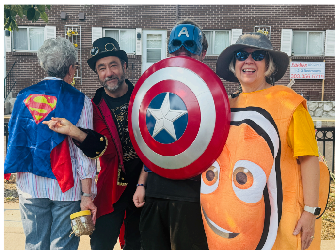
Superheroes at the Carnation Fest Parade. Glory of God Lutheran Church