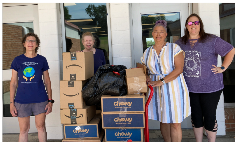
Delivering school supplies to Everitt Middle School.