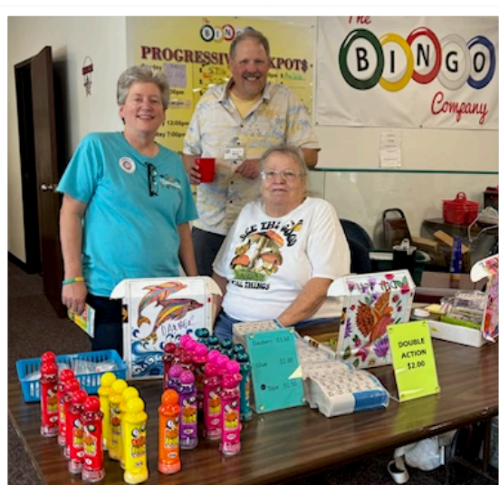
Thank you to all our Volunteers at Bingo.